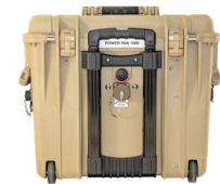
24VDC Power Pak 1000 Item # 21-0102201