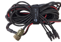
12VDC Flexi-Panel Leash 25 ft Item # 13-0000039