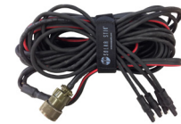
24VDC Flexi-Panel Leash 25 ft Item # 13-0000040