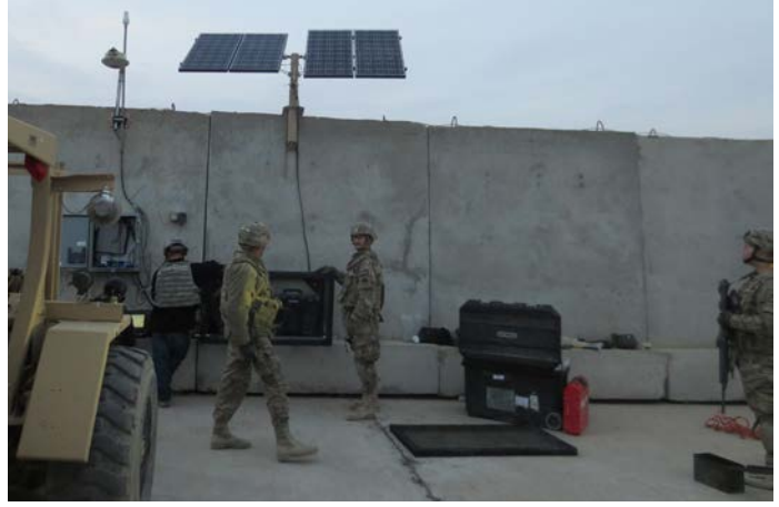
Figure 6 - Interrogator powered by Solar Stik solar generator

As shown in Figure 5, the Solar Stik 400 was able to generate enough power to keep the batteries charged during the day leaving plenty of stored energy to support the RFID Interrogator overnight. During ideal conditions, the battery state of charge (SOC) never dropped below 80%, ensuring the RFID Interrogators had ample power. The solar power systems provided by Solar Stik were also sized to ensure there was sufficient energy storage available to survive several days of little to no sunlight. The RFID Interrogator Systems powered by Solar Stik's portable solar generators operated without grid connectivity and eliminated the logistical challenges associated with using fossil fuel generators.