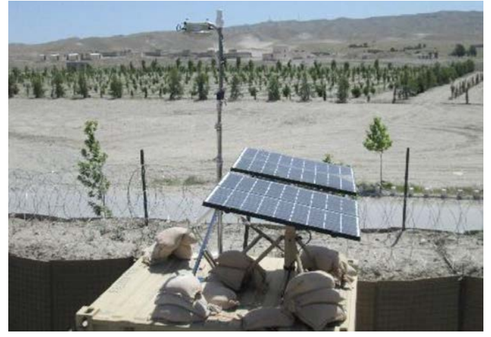
Figure 7 - Solar Stik System powering RFID Interrogator at a convoy rest stop