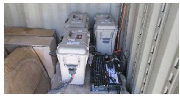
Figure 4 - Solar Stik Solution powering Interrogator System with a computer