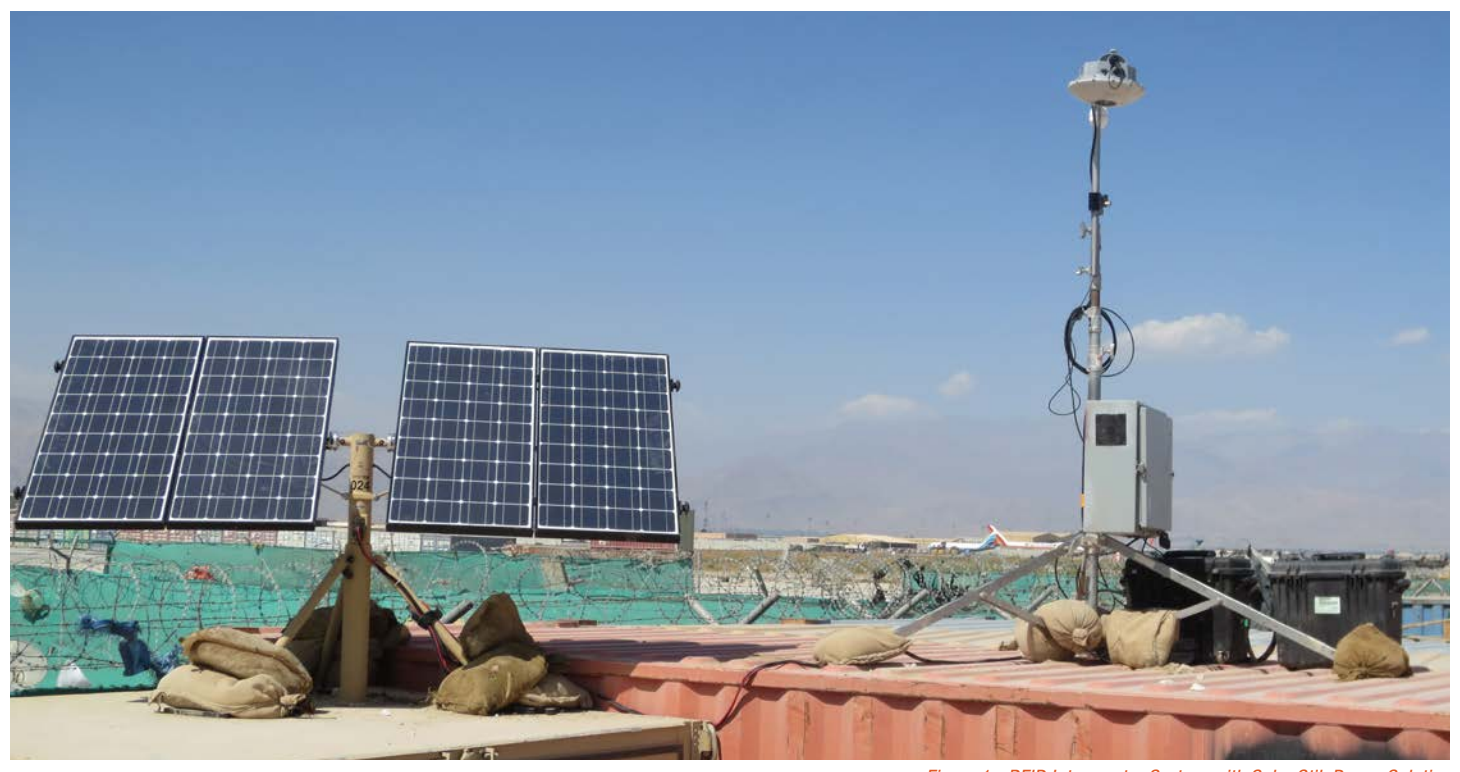
Figure 1 - RFID Interrogator System with Solar Stik Power Solution

Portable Solar Generators for the RF-ITV System