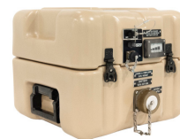
24VDC Li ESM 2000 Item # 21-0202317