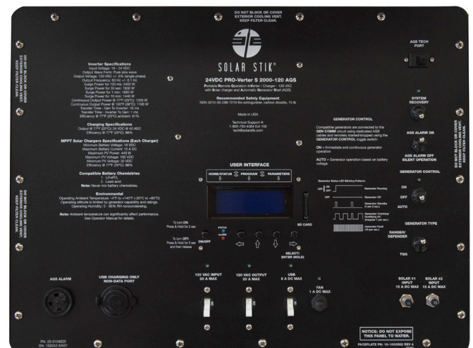
PRO-Verter S 2000 Faceplate