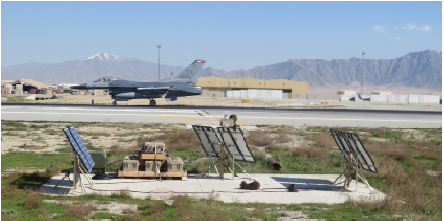
Figure 1 - TALS with 3kW HPS on One End of the Runway