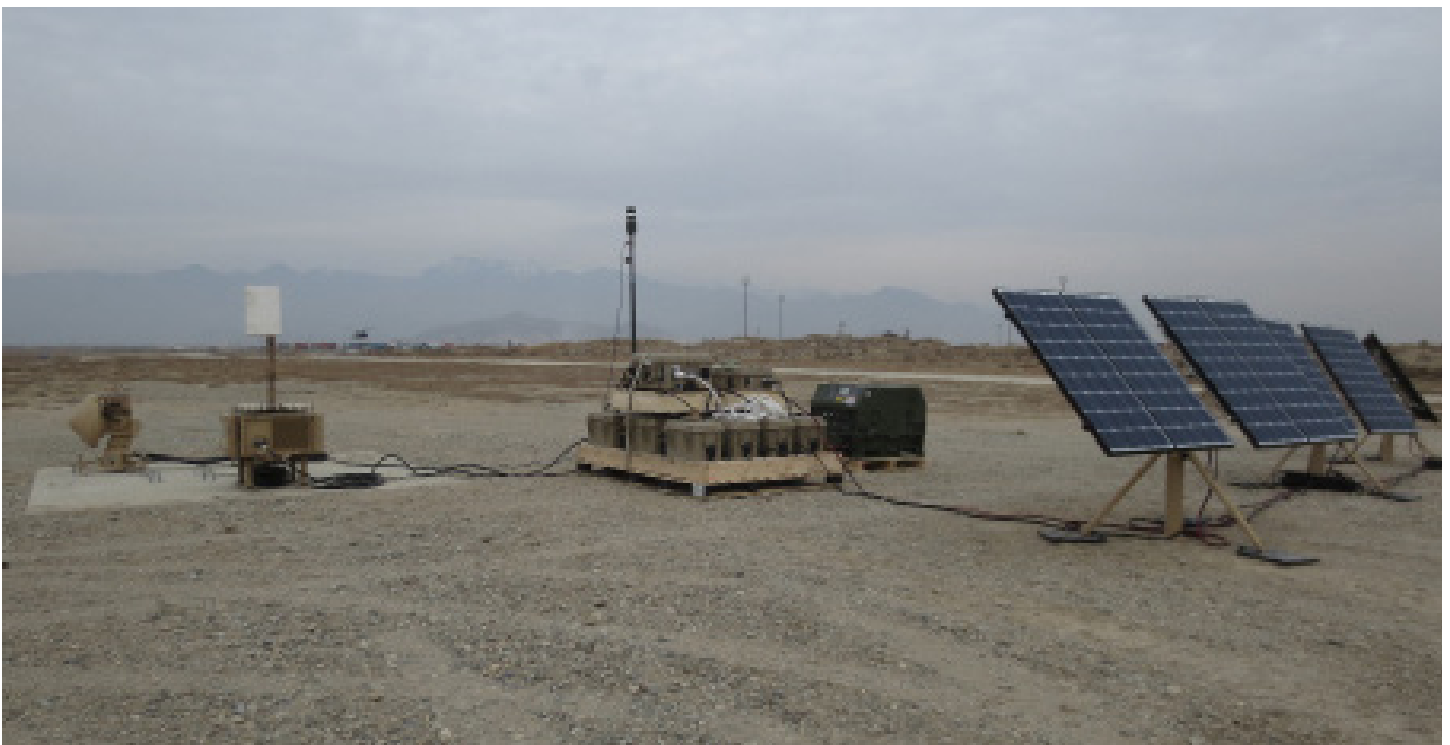
Figure 4 - TALS with the 3kW HPS on the Other End of the Runway