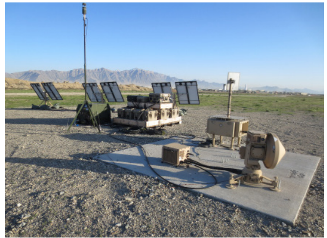
Figure 2 - TALS Installation at Bagram AFB

The 3 kW TQG is the smallest variant in the U.S. Army inventory. The TQGs at BAF ran constantly, producing 3 kW of energy to power the 240 W TALS load to support UAV operations. The TQG had to be refueled twice daily since it was running continuously. Roughly 90% of the TQG power output and of the fuel consumed was wasted in this system configuration.