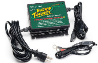
Charger, 24VDC Pb Pak, 120VAC Item # 07-1000762