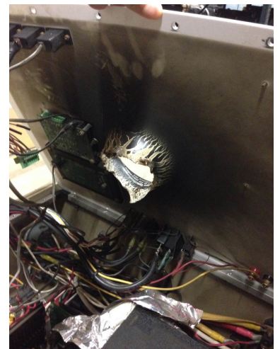
This PRO-Vert 7000 was connected to 230 VAC/50 Hz power.