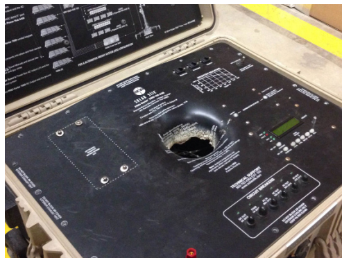
DON'T LET THIS HAPPEN!